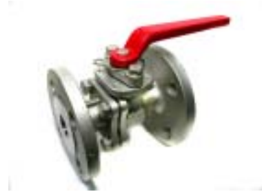
Two Piece Flange Ball Valves