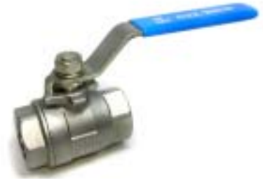
Two Piece Ball Valves