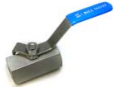
One Piece Ball Valves