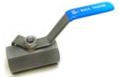
One Piece Ball Valves