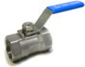
One Piece Ball Valves